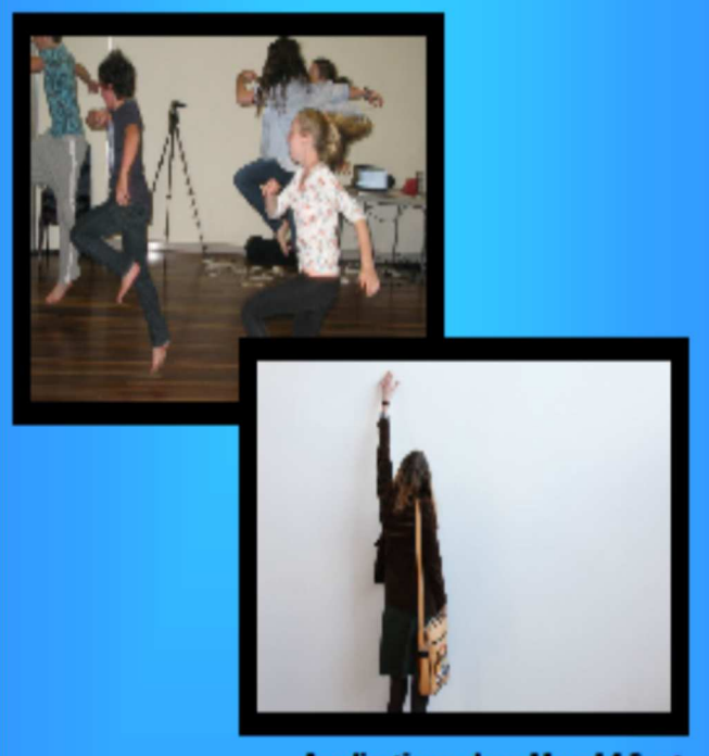
Applications close Mon 14 Sept.

Workshops take place over a week and will culminate in a final showing or film.